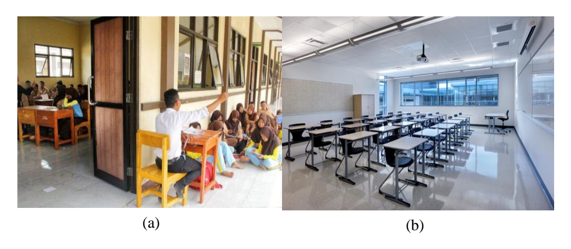
Figure 4 . The condition of existing (a) and modern classrooms (b).

An existing vocational school building facility may be observed in Fig. 3(a) whereas a modern one is observed in Fig. 3(b). The standard of a modern vocational school building facility according to the 4.0 industrial revolution era is having a building with a stable, sturdy, earthquake and other natural forces resistant construction, and also complying good health standards. Utilization of building roofs as a source of electricity with the use of solar panels can be an option to optimize the space of the building. All existing systems [13] in the building is provided with technological facilities in accordance with the 4.0 industrial revolution era, namely Internet-based technologies of things and data of things. The building is equipped with Internet technology and information systems with a reliable system, security, smart features, flexibility, and mobility, which may be access by students and teachers. Electrical installations [14] must also be flexible, safe, and provide the capacity to support dynamic electricity use.