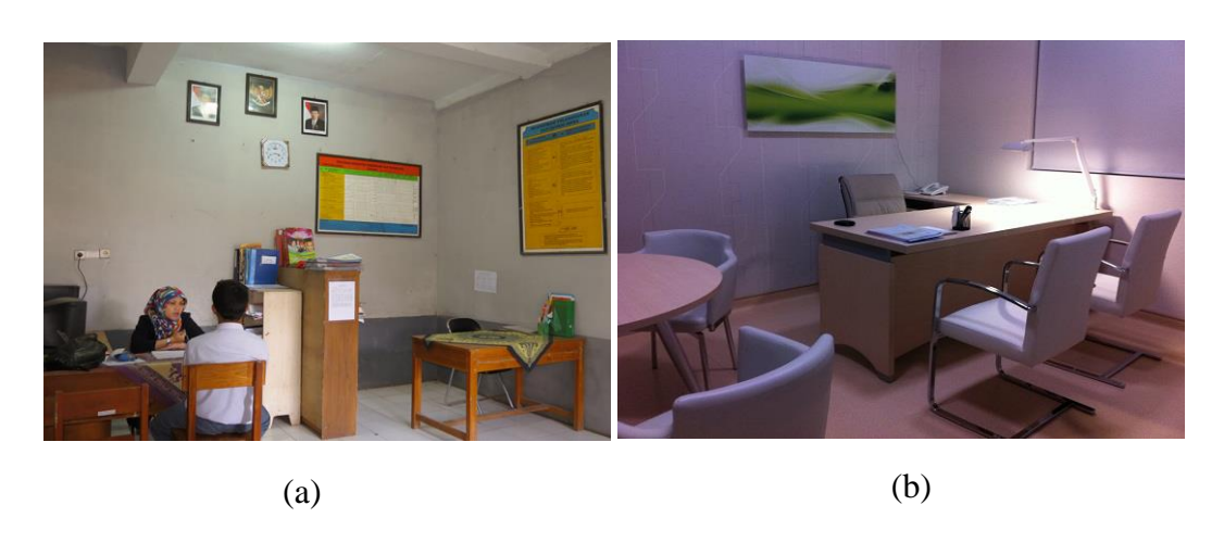
Figure 9. Current counseling facility (a) and modern counseling facility (b).

Counseling guidance facility is also an important element of health services in a school. This facility is intended for students that face problems in their study, whether it is personal or academic. A student who is not achieving his or her potential may be referenced to the counseling staff of the school. The counseling guidance facility is used primary to be a space for dialogues and consultations between students and the counseling staff. Hence, this facility needs to be clean and comfortable such that students feel welcomed and may willingly reveal their problems and solve them. Furthermore, the facility needs to have a sense of privacy as well. It may be observed that the current counseling facility seen in Fig. 8(a) is too open hence there is a lack of privacy, which may hamper the consultation process. However, if the facility is prepared as in Fig. 8(b) then students may be willing to conduct consultations.