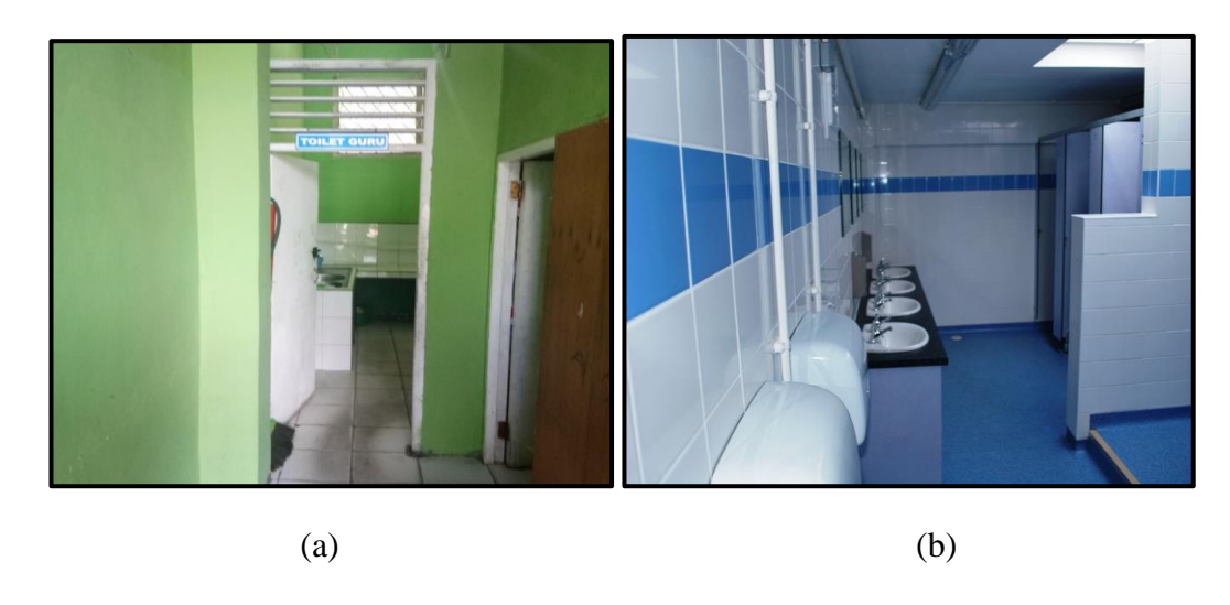
Figure 10. Current toilet facilities (a) and modern toilet facilities (b).

exists for students and teachers. Toilet facilities must be equipped with convenient and closed hand washing materials, and furthermore they must be cleaned and maintained to ensure clean a functional toilets every time [16]. The usual existing toilet facilities may be observed in Fig. 10(a), whereas modern toilet facilities is given in Fig. 10(b). It may be observed from the figure that there is not so much different between the existing and modern toilets, however, additional equipment, such as hand dryer should be installed in the existing toilet facility. The cleanliness of existing toilets in schools are usually very poor and this problem needs serious solutions.