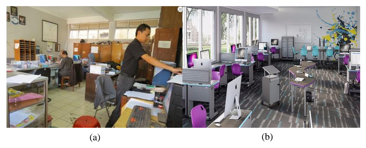
Figure 6 . Existing (a) and modern administration rooms (b).

1273 (2019) 012048 doi:10.1088/1742-6596/1273/1/012048