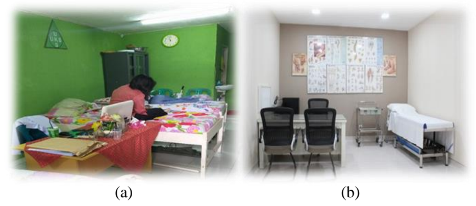
Figure 8. Existing health service (a) and better health service (b) facilities.

health service facility may be observed in Fig. 7(b). We can observed that the room has an appropriate patient bed and the surrounding of a health service center with posters on the wall showing health illustrations.