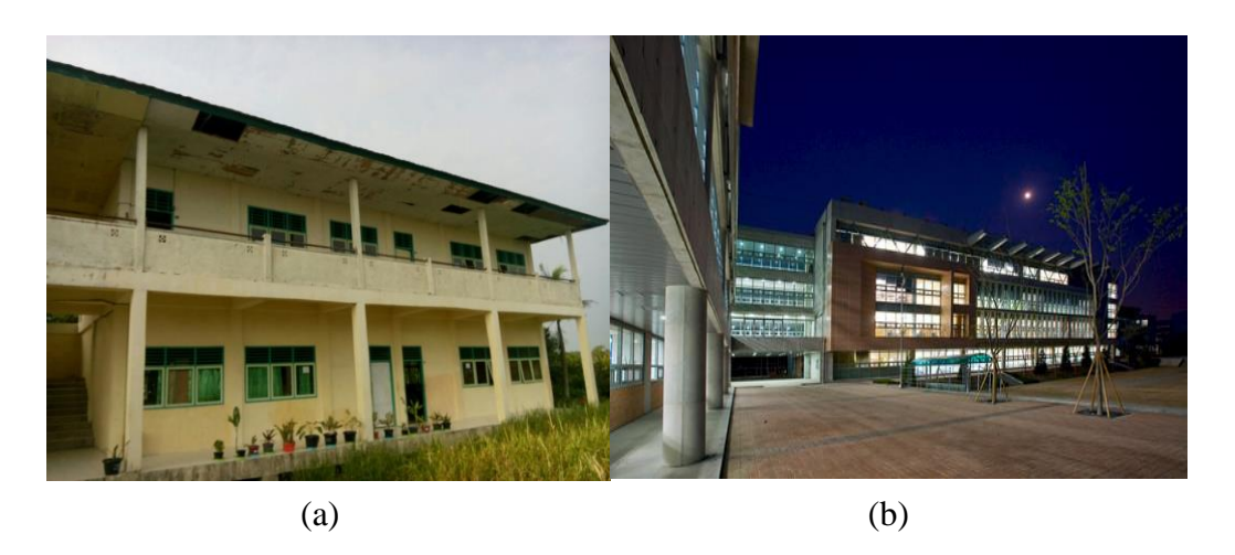
Figure 3. Existing (a) and modern (b) vocational school buildings.

Educational institutions that have adequate facilities are ideal for students and teachers. But in reality, lighting [12] and comfort of space, for example, for teaching and learning processes or other facilities supporting the learning process in vocational schools are currently very underwhelming. The current conditions of many vocational school buildings based on the results in the field do not meet both the quality and quantity of adequate and modern building standards. The conditions of the existing vocational school facilities still needs to be improved, especially instruments and equipment that have not been adjusted to the modern standards. Data in the field shows that vocational school facilities along with instruments and equipment are still inadequate. Many of these building facilities are found with i) less lighting; ii) high temperature (in the room); iii) inadequate toilets; and iv) untidy placement of installation cables. A modern vocational school facility standards are needed to support the performance of students, teachers, technicians, and people who are directly involved in the school.