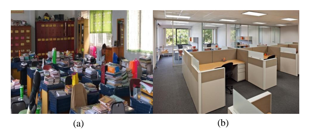
Figure 7. Existing (a) and modern (b) teacher rooms.

The teacher's work-space so far has been largely unrepresentative to support the development of teacher's capacity and professionalism. This may be observed in Fig. 6(a). It may be observed that the work-space of teachers is not tidy and looks messy without any boundaries of privacy for each teacher. Hence, this may result in an unproductive work environment. A modern design of work-space for teachers may be observed in Fig. 6(b). The design provides a sense of privacy for each teacher, hence making it suitable to prepare for teaching materials. However, the boundary does not totally isolate each teacher, such that teachers may still communicate with each other. The work-space for teachers should be close to the classrooms, and equipped with tables, chairs, cupboards, internet channels, CCTV and washbasins for hand washing.