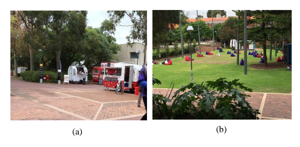
Figure 12. Outdoor study room and schoolyard of modern school.

Other supporting facilities, one of which is the layout of the school, is another factor in needs to be standardized. Schoolyard must have safe and controlled access (entrance and exit) system by separating pedestrians and vehicle traffic lanes [see Fig. 12(a)]. In addition, parking spaces also become a necessity for students who use vehicles, especially motorcycles. Hence, a large parking lot is needed, which is based upon the number of residents in the school. Water drainage system must be able to supply, drain, and dispose water properly.